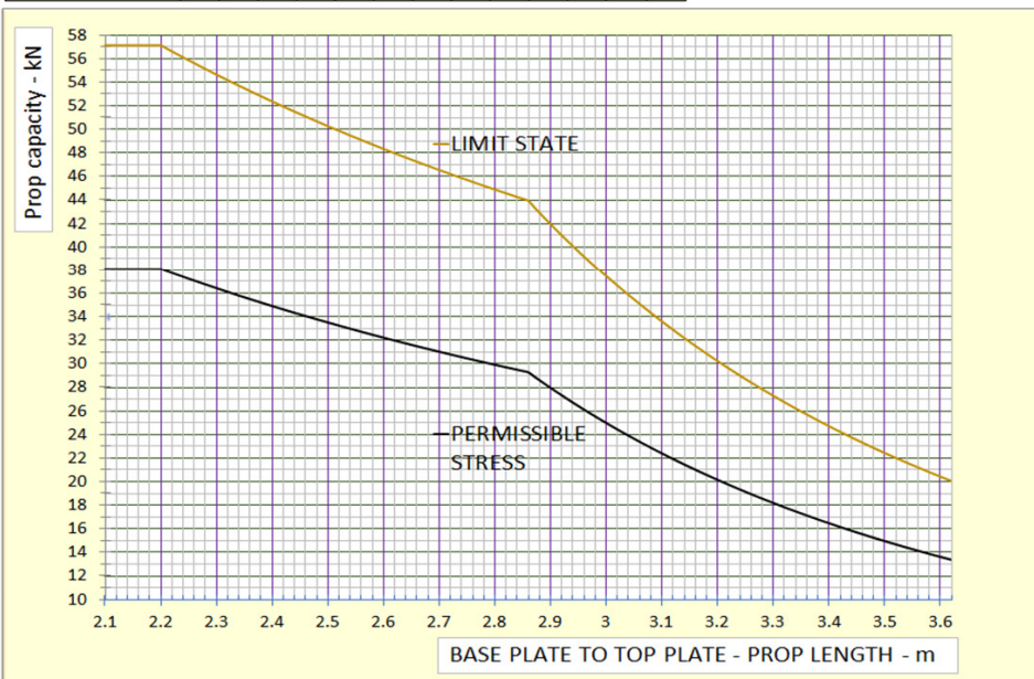
0.5m Extension under B35 Prop, with bracing from support to above extension